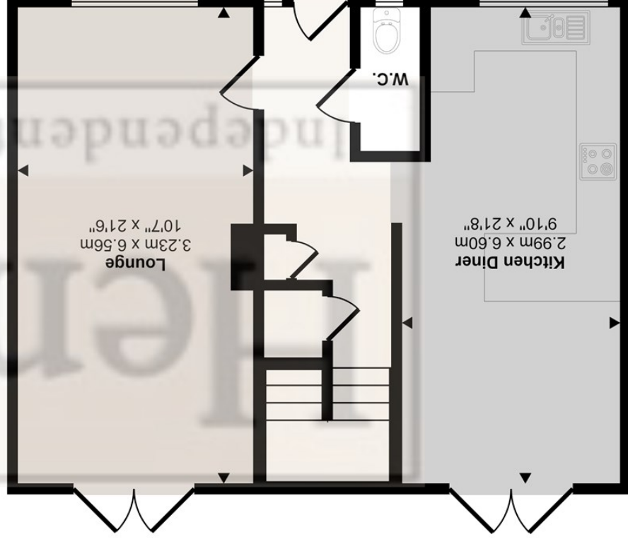
Approx Gross Internal Area 99 sq m / 1068 sq ft